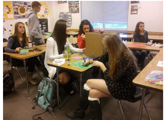
Key Club members make food drive posters at December 3 meeting

Members of the Monarch Key Club organized a food drive at the high school from December 7-21, with all donations given to the Louisville Food Bank to help need families in our area.