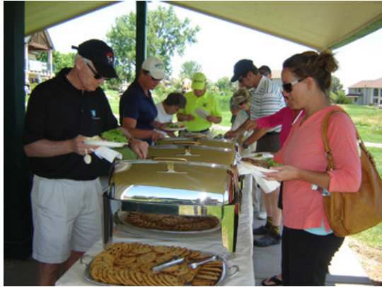
Tourney golfers enjoy a delicious lunch after course play ends