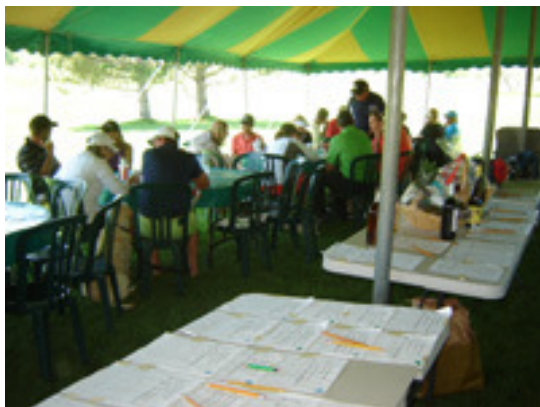
Golfer and volunteers have lunch before the presentation of tournament prizes and close of silent-auction bidding