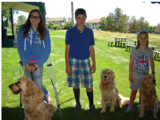
Special guests at the luncheon were these three beneficiaries of our club's Alert Dog Program who received dogs that were trained to protect them from allergy or diabetes reactions