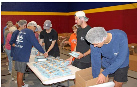
Five of the 15 CU Circle K members packing kits