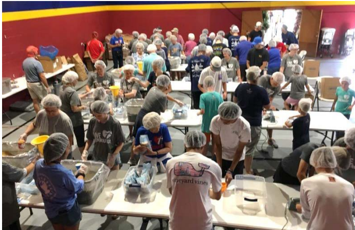
Twelve member teams in assembly process at 5 tables