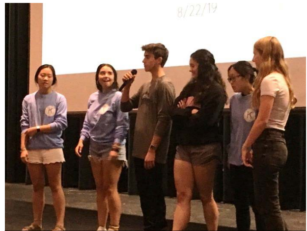
Officers give membership education presentation