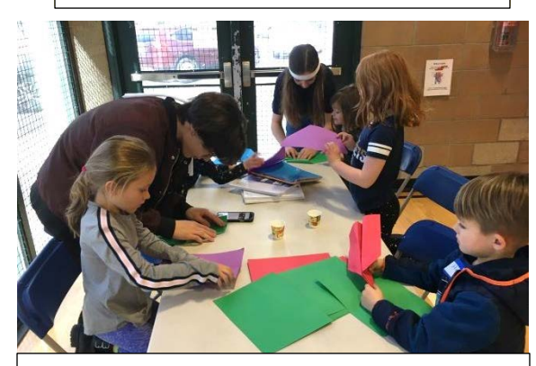
Making paper airplanes is fun