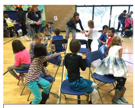
Students play musical chairs