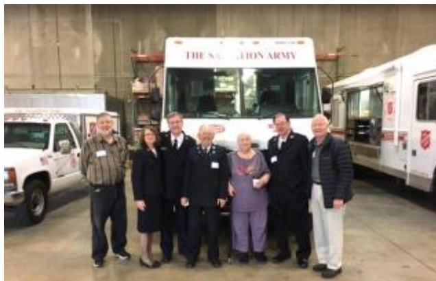
Broomfield group pose in front of kitchen truck

At the conclusion of the breakfast ceremony, attendees were given a tour of the service center. It has 50,000 ft. 2 of storage and office space. The service center is the logistical hub for the division with service trucks, kitchen trucks, kitchen kits, and social services equipment; e.g., bedding, furniture, and kitchen items. They have the capability of serving up to 3,000 meals/day to volunteer workers during a natural disaster.