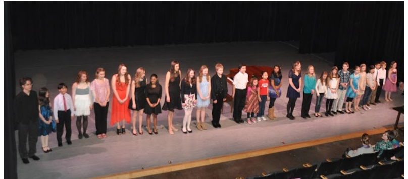
Contestants are recognized on stage at the Dairy Center