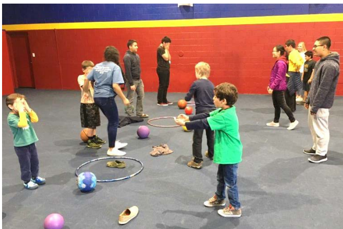
Children having fun at The Salvation Army gym