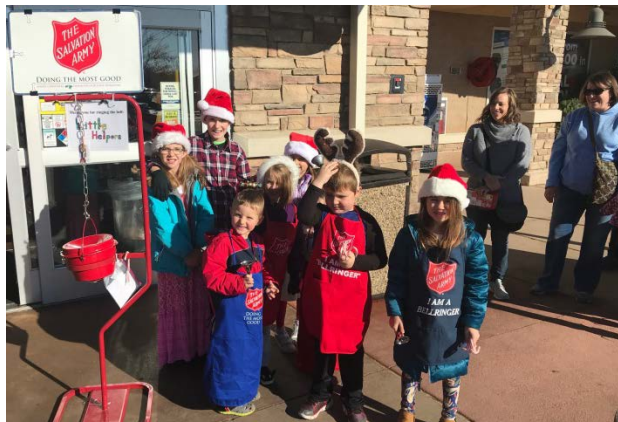
Little Helpers ring the bells