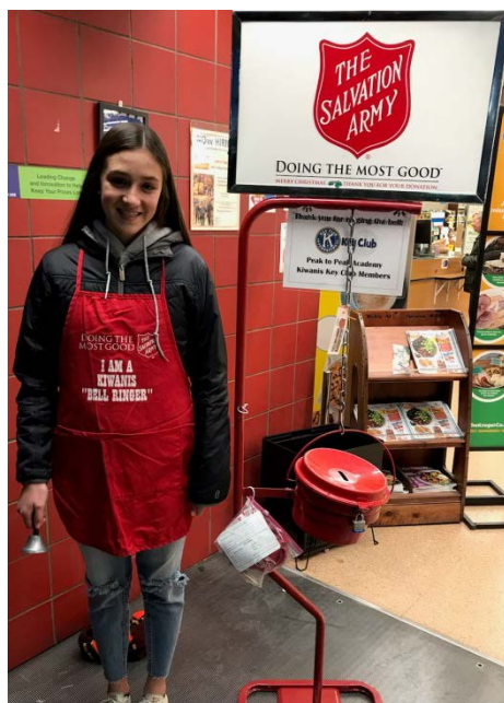
Another Peak to Peak Key Club ringer!