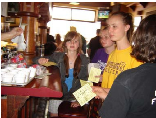
Boulder Girls' Softball ticket holders at Boulder Cafe