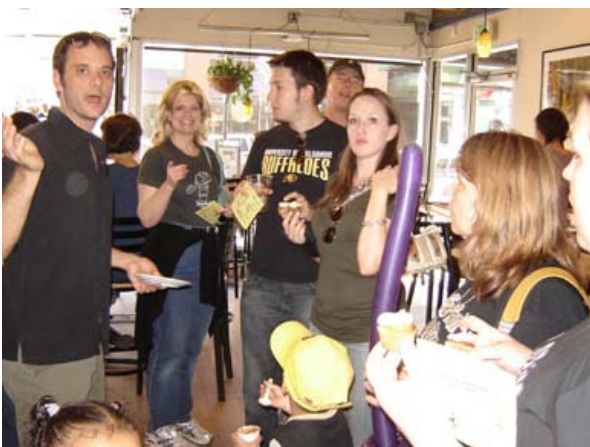
Taste participants at "The Cup Espresso Café"