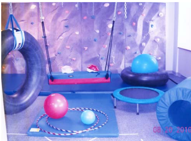
New climbing wall at Mapleton Rehab