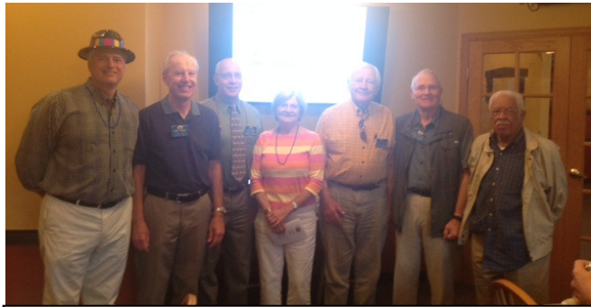
Past Presidents at the Installation Meeting