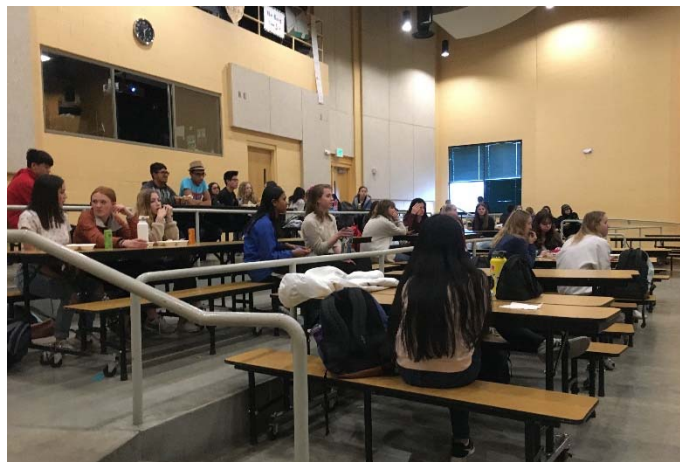
Students at Key Club noon lunch meeting

About 60 students attended the club meeting in the school’s Auditoria. The officers conducted the meeting. They announced two meetings: Spring Rally February 22 from 11am-2pm in the cafeteria and DCON March 27-29 at Denver Sheraton. The next service project is Shoe & Clothing Collection on March 10-16.