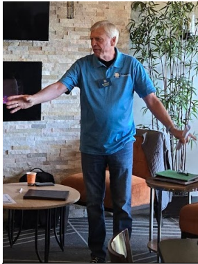
The fish was THIS BIG