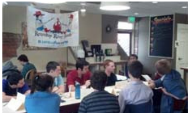
"Trivia on the Hill" - put on in part by CU CKI