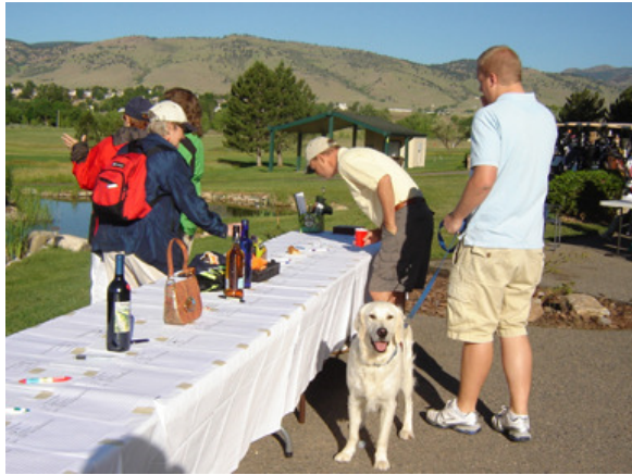
Golfers look at silent auction items before teeing off