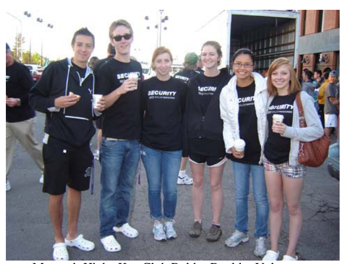
Monarch Highs Key Club Bolder Boulder Volunteers