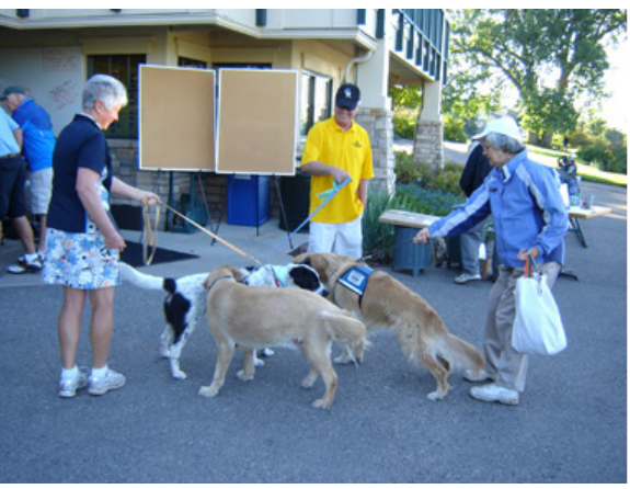
Dogs brought to the tourney meet each other before tee-time