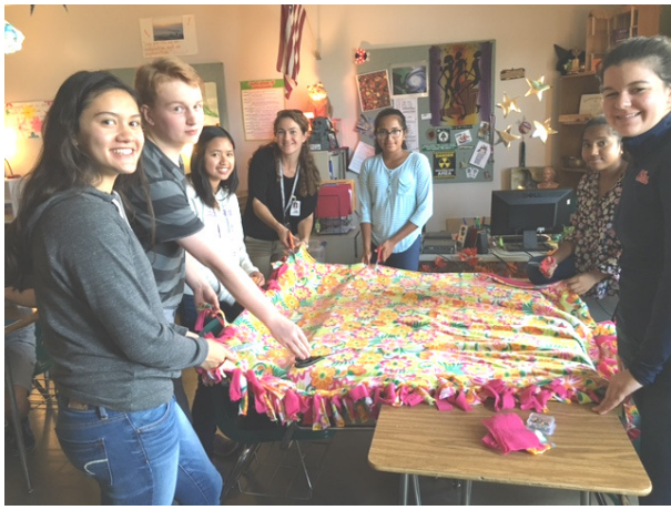
Key Club members working on warm blanket