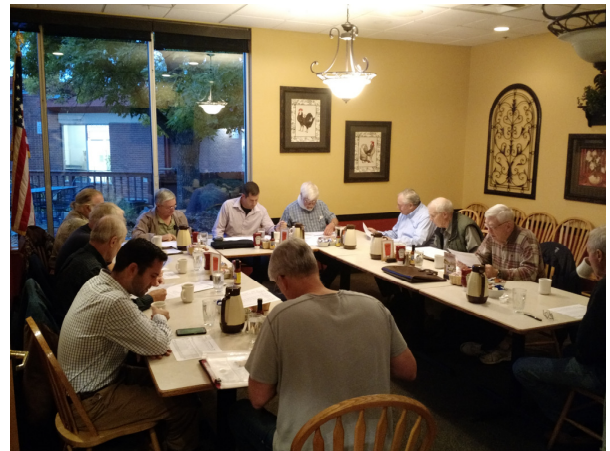
Board of Directors hard at work at October 6 meeting

The photo below shows the Board of Directors at its first meeting of the 2016-17 Kiwanis Administrative year. All of our members are invited to attend the Board meetings, which are held at 7 am on the first Thursday of each month at the Egg & I Restaurant.