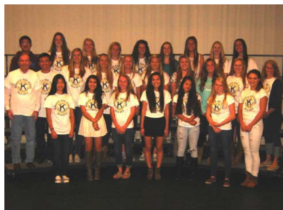
Yearbook photo for Monarch HS Key Club