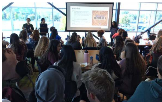
Over 75 students attend recent meeting