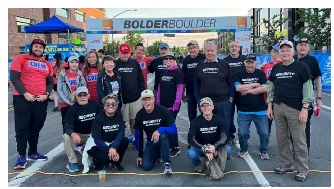
Kiwanians, friends, and family just before the first wave.

25 members of Foothills Kiwanis, including family and friends, helped patrol the BB starting line, once again. Working security and having to play the "bad cop" occasionally is something we're not all suited for. But we rose to the challenge and had a lot of fun too. This is a major fundraiser for our club's administrative and general activity account. Thanks for volunteering.