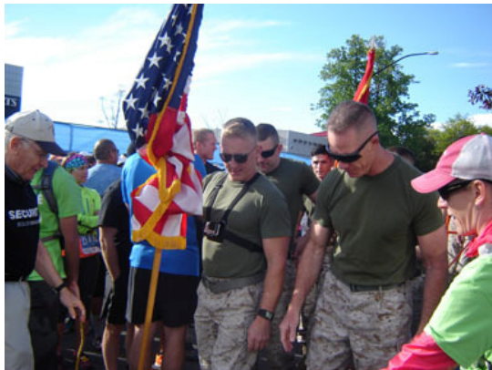
U.S. Marines group goes through the Bolder Boulder Starting Line