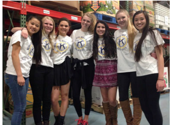
Monarch Key Club volunteers sort donated food items at Louisville Food Bank on February 10, 2015